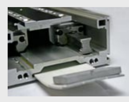
High quality, precise, and lightweight components like our linear slide mechanism and non-slip cogged belt make the PanelPRO robust and durable.