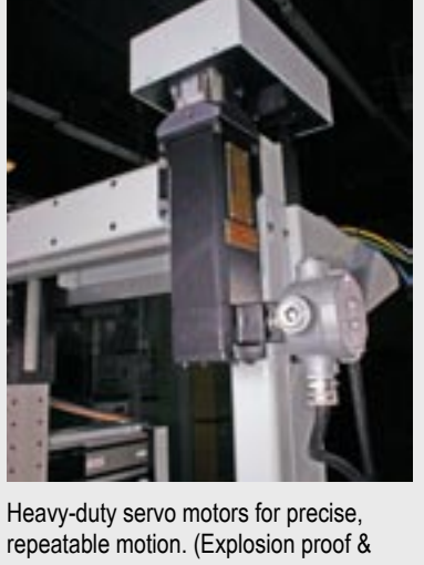
dust tight wiring available.)