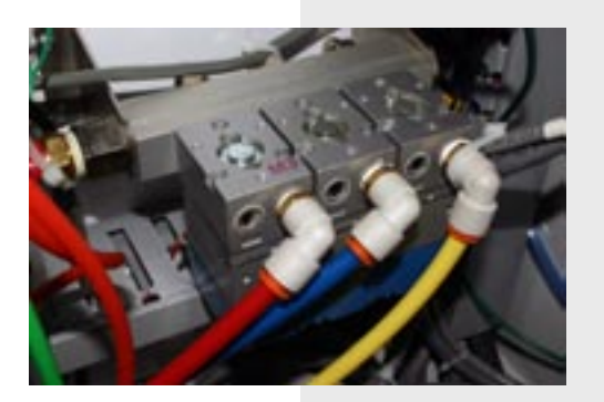
Pressure transducers allow digital control over all spray functions such as fluid, atomizing air & shaping air.