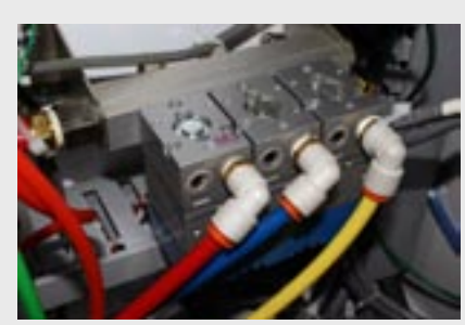
Pressure transducers allow digital control over all spray functions such as fluid, atomizing air & shaping air.

For More Information Contact sales@artomation.com