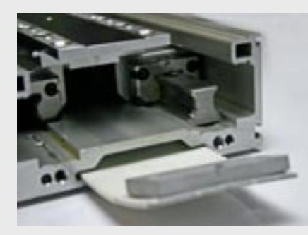
High quality, precise, and lightweight components like our linear slide mechanism and non-slip cogged belt make the Max Series robust and durable.