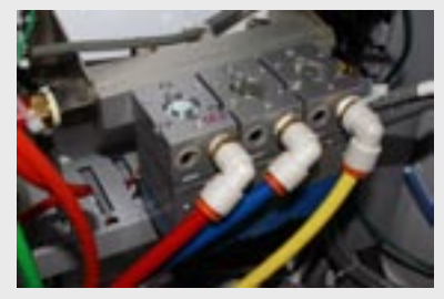
Pressure transducers allow digital control of spray functions including fluid, atomizing air & shaping air.