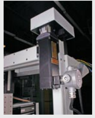
Heavy-duty servo motors for precise, repeatable motion. (Explosion proof & dust tight wiring available.)