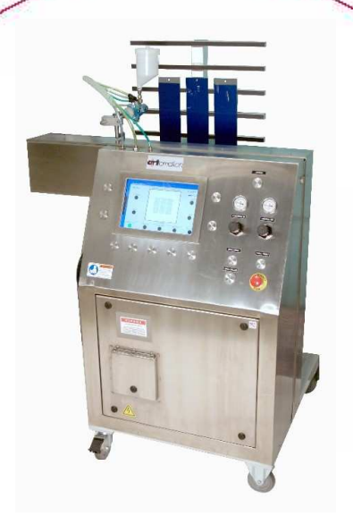
PanelPRO Jr. System

Each time a recipe is executed, usage statistics such as the time of day and recipe settings are recorded. The system automatically records this information to a standard USB drive and can be easily transferred to a standard PC. Recipes are automatically backed up to the USB drive weekly.